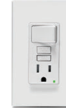
15A-125V@ Outlet, 20A-125V Feed-Through 15 Amp @ 120 VAC Switch rating Cat. No. GFSW1 (TR)