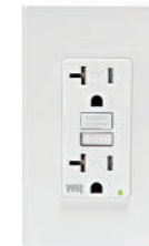
20A-125V@ Outlet 20A-125V Feed-Through Cat. No. GFWR2 (TR) Cat. No. GFWR2 (NTR)