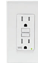
15A-125V@ Outlet 20A-125V Feed-Through Cat. No. GFWR1 (TR) Cat. No. GFWR1 (NTR)