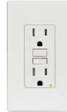
15A-125V@ Outlet 20A-125V Feed-Through Cat. No. GFTR1 (TR) Cat. No. GFNT1 (NTR)