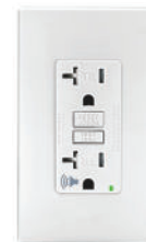
20A-125V@ Outlet 20A-125V Feed-Through Cat. No. GFTA2 (TR)