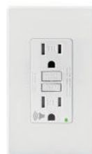
15A-125V@ Outlet 20A-125V Feed-Through Cat. No. GFTA1 (TR)