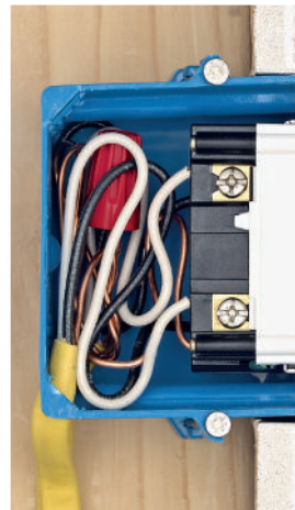
Other GFCI Models