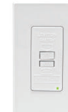
20A-125V Feed-Through Cat. No. GFRBF