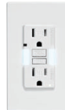
15A-125V@ Outlet 20A-125V Feed-Through Cat. No. GFNL1 (TR)