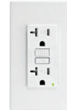
20A-125V@ Outlet 20A-125V Feed-Through Cat. No. GFTR2 (TR) Cat. No. GFNT2 (NTR)