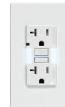
20A-125V@ Outlet 20A-125V Feed-Through Cat. No. GFNL2 (TR)