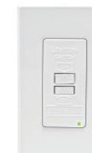
20A-125V Feed-Through Cat. No. GFRBF