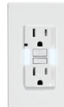
15A-125V@ Outlet 20A-125V Feed-Through Cat. No. GFNL1 (TR)