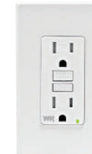
15A-125V@ Outlet 20A-125V Feed-Through Cat. No. GFWR1 (TR) Cat. No. GFWR1 (NTR)