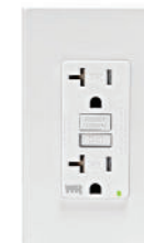
20A-125V@ Outlet 20A-125V Feed-Through Cat. No. GFWR2 (TR) Cat. No. GFWR2 (NTR)