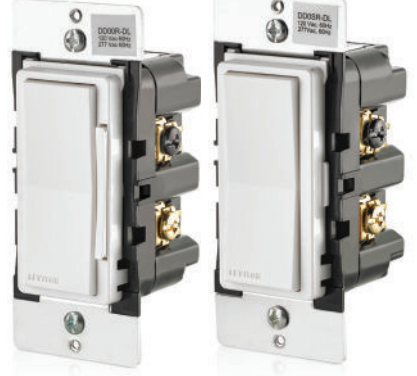
DD00R and DD0SR Wired Dimmer and Switch Companions