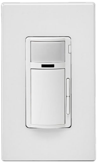
D2MSD Motion Sensing Dimmer