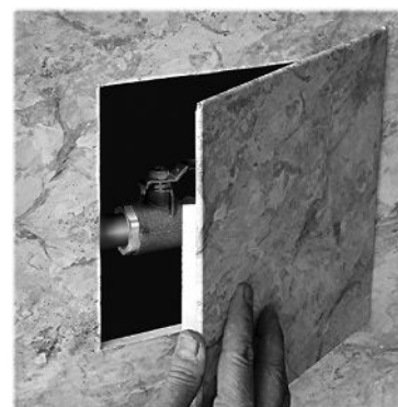
SpringFit Access Panel

Template is provided if cutting is necessary.